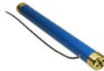
969 HVD Hochspannungsteiler